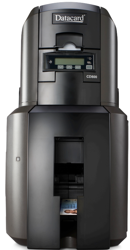
Datacard® CD800™ Card Printer with inline lamination module