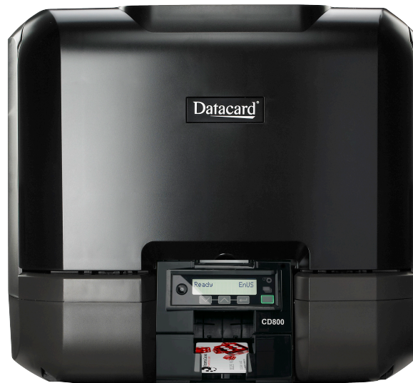
Datacard® CD800™ Card Printer with optional multi-hopper