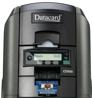
Datacard® CD800™ Series Card Printer